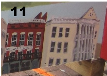
11 Clinton Hall and Clinton House, City of Ithaca. The Clinton House (1828) and Clinton Hall (1847) were developed by a group of businessmen as Ithaca's earliest hotel-commercial-office complex. The buildings were added to the National Register of Historic Places in 1971 and 1988, respectively.