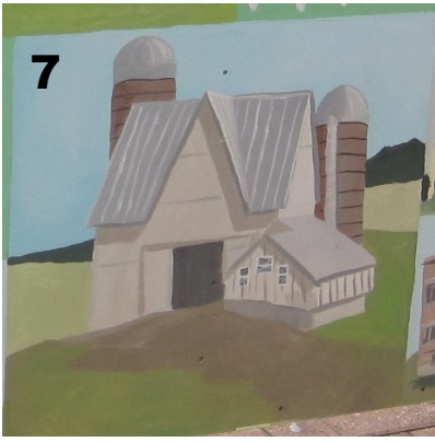
7 Carpenter Barn, Town of Dryden. This 1853 dairy barn, with its distinctive cross-gables and steeply pitched roof, was recently restored by the Carpenter family.